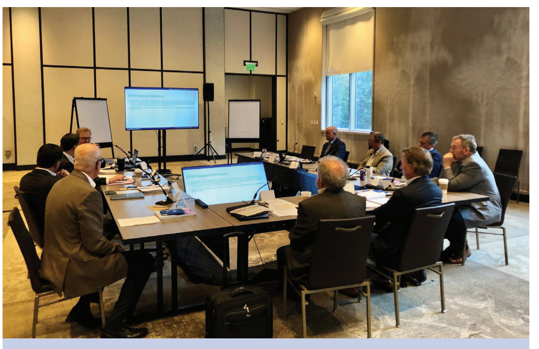
CEO Executive Roundtable in Atlanta, Georgia, co-sponsored by the Foundation's Institute for Performance Excellence and Institute Trustee ABOUT Healthcare.