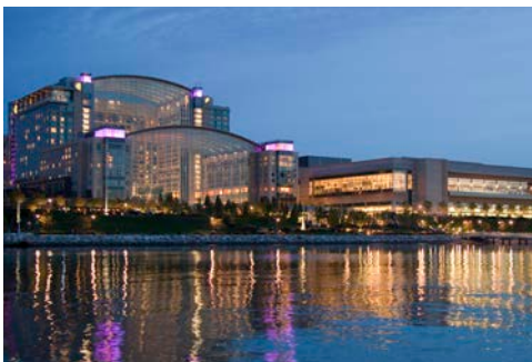
The Quest conference will be held at the Gaylord National Harbor.