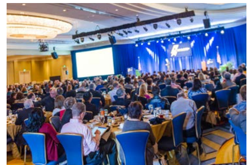
A view of the ballroom from previous Quest conferences.