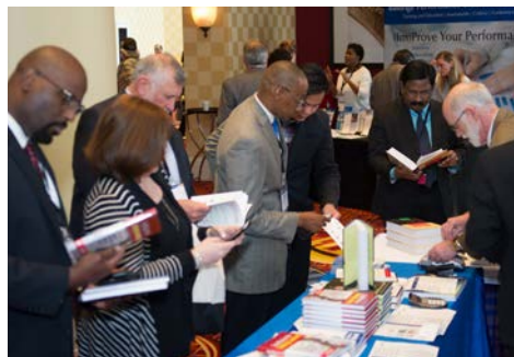
Time scheduled for networking and book signing!