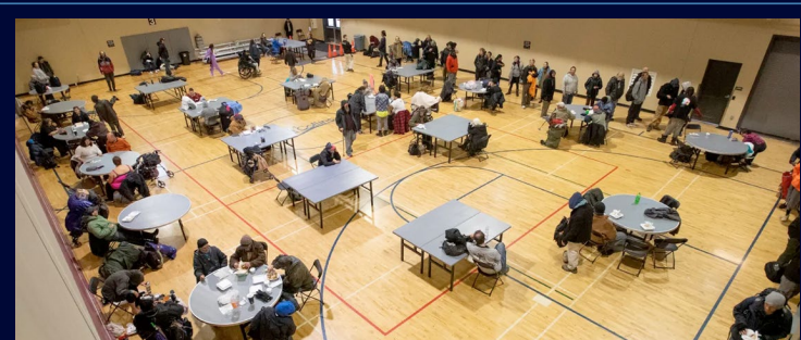
Social Sustainability – Northside Homeless Shelter