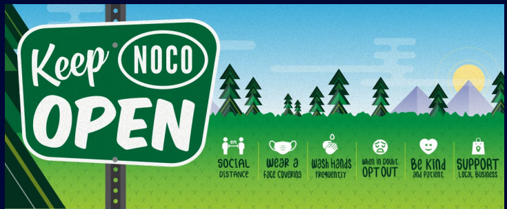
Keep NoCo Open Regional Campaign