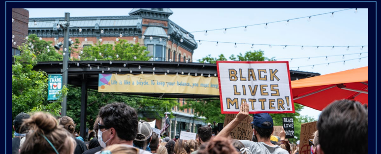
Community Voices/Peaceful Protests