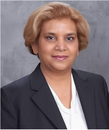
Executive Vice President, SANPEC, Inc.

"On behalf of Team SANPEC and the infrastructure community, I am honored to receive the Baldrige Foundation Award for Leadership Excellence in Business. Leadership is a higher consciousness within, attuned with God's vibration, that organizes internal parts to restore the light of truth and continuously evolves to sustain the greater good.