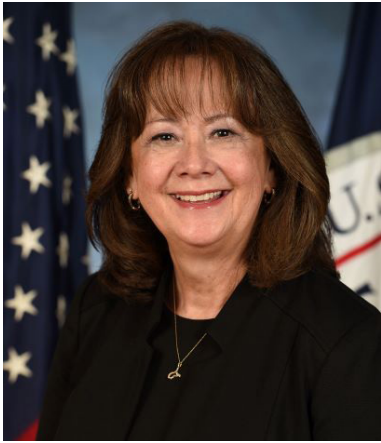
Managing Director, Cyber Readiness Institute

"I am so honored to receive the Baldrige Foundation Award for Leadership Excellence in Cybersecurity. Throughout my career, I have had the opportunity to work with outstanding people who are dedicated to making a difference by stepping up to the challenge of making our organizations more secure through leadership, education, and innovation. The Cyber Readiness Institute is focused on human behavior and working with the leadership of small and medium-sized businesses to create a culture that is cyber ready. In conjunction with the Baldrige Excellence Framework, with their Core Values and