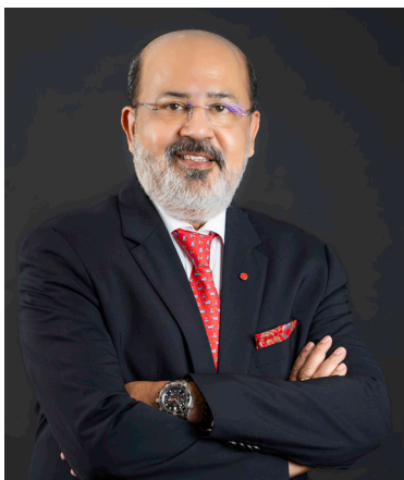
Director, Tata International West Asia

“The Malcolm Baldrige National Quality Award provides Excellence impetus across the world. A diverse group like Tata adopted it as an Excellence Model three decades ago due to its non-prescriptive nature. It continues to serve Tata as an ‘Excellence Navigation System.’ Over time, it has changed the DNA of Tata to become globally competitive and helped develop a common vocabulary and measurement for excellence. Some companies across the world falter when they initiate the excellence journey simply with a view to win an award, and excellence then bleeds out of the organization