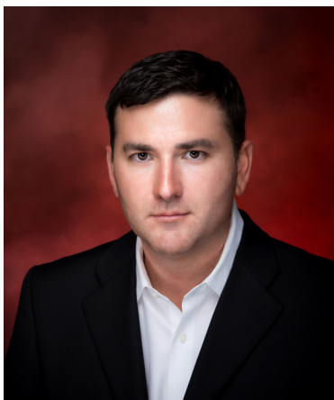
Executive Director, The Charter School of San Diego

“For nearly 20 years the Charter School of San Diego has embraced the Baldrige Excellence Framework as our guide toward high performance. Last year our school became the first education organization to receive the Baldrige Award twice, and now this year I am honored to accept the Baldrige Foundation’s Leadership Award. It is a joy to work at a place where every day we know the hard work and dedication of our staff is directly Transforming the Lives of students who need it most. Our Baldrige Journey is a big part of why our school has been so successful, and we look forward to continuing to