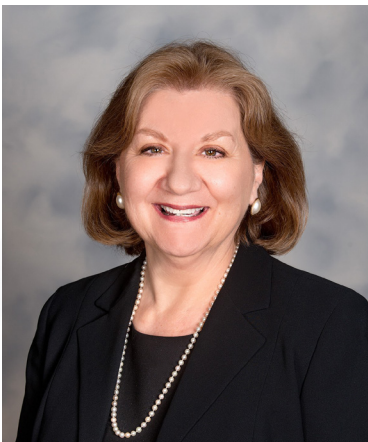
Formerly Performance Excellence Coach, UPMC Western Maryland and Chief Strategy Officer, Charleston Area Medical Center Health System

“It is such an honor to receive the 2023 Baldrige Foundation Award for Leadership Excellence. Baldrige has been a significant and meaningful part of my career. I have had the privilege of experiencing first-hand how organizations improve when they embrace the Baldrige Framework. A real cultural shift occurs when every person in an organization understands how his or her day-to-day work can improve quality and achievement of the organization’s goals. Most recently, I have been privileged to work with Communities of Excellence, both as a participating community and then as faculty. I know that COE is a key driver of the change so needed in our communities today. A special thanks to my Baldrige family of friends who make this journey so gratifying and enjoyable!”