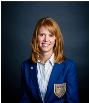
Vice President of Quality Management Systems, MidwayUSA

“Baldrige has been a critical piece of the MidwayUSA success story for the past 19 years. I have had the privilege of witnessing firsthand how an organization can be transformed when it fully commits to using Baldrige as the leadership and management framework for running their organization. I am honored and thankful to be recognized by the Baldrige Foundation as a recipient of the 2023 Baldrige Foundation Award for Leadership Excellence and am grateful for the opportunity to work with the extraordinary