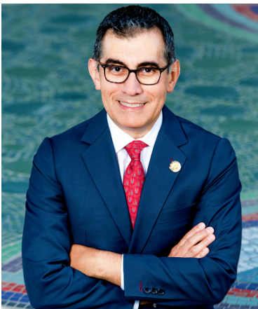
Chancellor, Alamo Colleges District

“At the Alamo Colleges District, we believe there is a leader in every seat. Creating an organizational culture where all employees and students can thrive begins with creating human-centered leaders who live our shared values—Students First, Community Engaged, Can Do Spirit, Respect for All, Collaboration, and Data Informed. By utilizing the education framework from the Baldrige Excellence Program, we can embrace our district-wide commitment to be best in class and move toward our district’s collective effort to empower our diverse communities for success.”