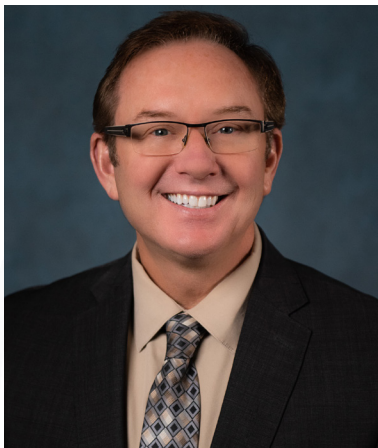
City Manager/Chief Executive Officer, City of Henderson, Nevada

"I am thrilled and deeply honored to be recognized with a 2023 Baldrige Foundation Award for Leadership Excellence. As City Manager and Chief Executive Officer of the City of Henderson, the Baldrige principles have been a driving force in how I lead our organization. The Baldrige criteria emphasis on systematic approaches have helped breakdown department silos and moved the organization forward as a whole: Our City's 97 percent customer satisfaction score for quality of life is the highest in the nation for mid-to-large sized cities. The criteria