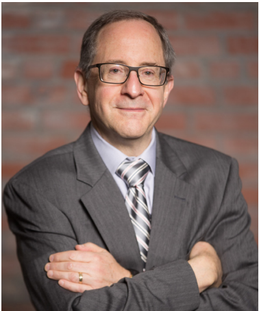
Vice President, College of Healthcare Information Management Executives (CHIME)

"I am honored to be a recipient of this Award. The Baldrige Foundation is synonymous with Excellence. It seems easy to recognize excellence but defining and measuring it never is. I have had the pleasure and responsibility of serving the cause of cybersecurity for almost four decades—before we had the word. One factor that always distinguishes quality leadership, though, is consistency. Keeping eyes on the goal, not the annoyances and setbacks but where you are going. Regardless of sector or industry—details may change but the need for security has only grown over those decades. The