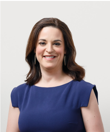
Senior Vice President and Chief Information Officer, Cook Children's Health Care System

"I am honored to receive the Baldrige Foundation Award for Leadership Excellence in Cybersecurity. The threats and exploitations by cybercriminals continue to increase in health care institutions at an alarming rate. Health care needs strong frameworks, processes, resources, and financial support. Organizations need leaders who are resolutely focused on this enterprise risk, nimble enough to adjust to changes, and understand that cybersecurity is a patient safety issue. The Baldrige Excellence Framework helps to create leaders with