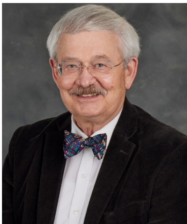
Vice President of Special Projects, Blanchard Valley Health System