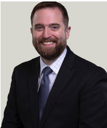
Vice President and Chief Information Security Officer, Intermountain Healthcare

"It is an extreme honor to receive the Baldrige Foundation Award for Leadership Excellence in Cybersecurity. Malcolm Baldrige said it best: 'Success is finding something you really like to do and caring enough about it to do it well.' The Baldrige Foundation is an inspiration to all leaders who have a passion to make the world a better place. Former National Cybersecurity Director, Chris Inglis, charged critical infrastructure leaders to construct our defenses in a way that our adversaries 'have to beat all of us to beat one of us.' I am humbled to carry one of