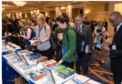
Time scheduled for networking and book signing!