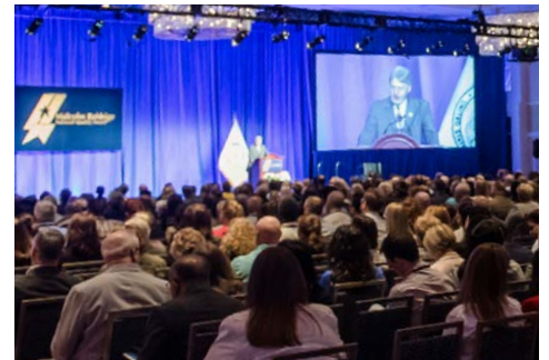
A view of the ballroom from previous Quest conferences.