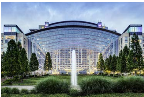
The Quest conference will be held at the Gaylord National Harbor.