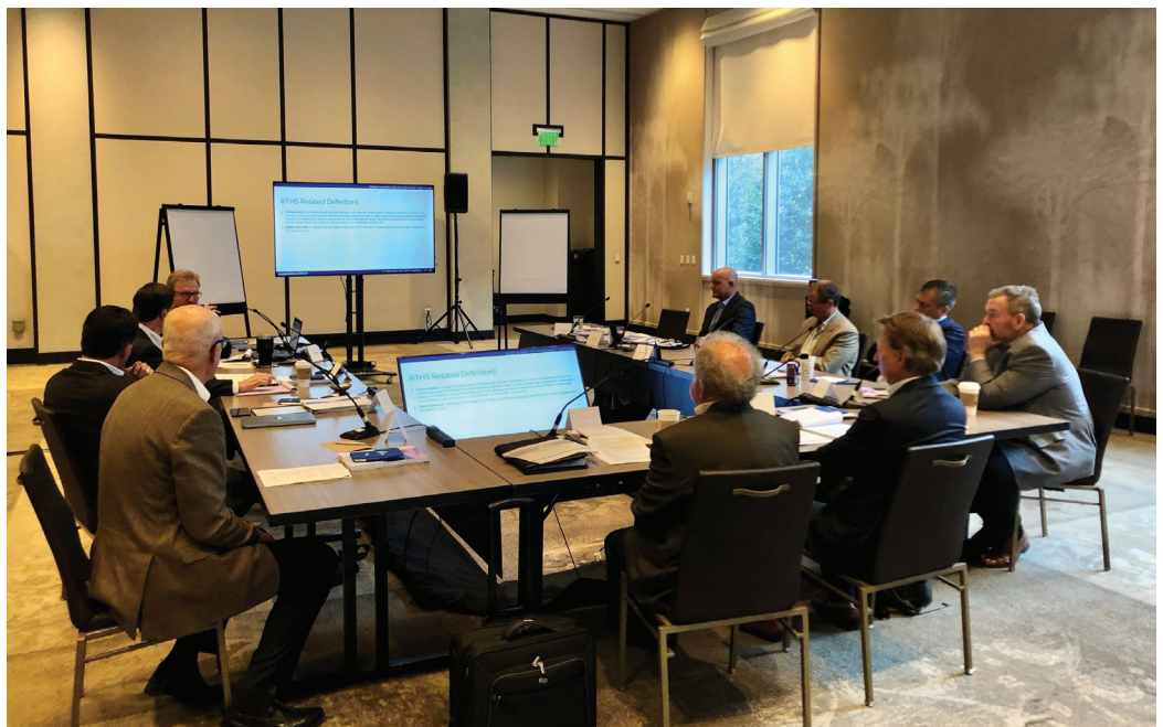
CEO Executive Roundtable in Atlanta, Georgia, co-sponsored by the Foundation's Institute for Performance Excellence and Institute Trustee ABOUT Healthcare.

The Dr. Curt Reimann Baldrige Scholarship provides recipients an opportunity to attend the Baldrige Examiner Training Experience, held each spring at NIST in Gaithersburg, MD. The scholarship was created to recognize and honor the important role played by examiners in the Baldrige Award process.