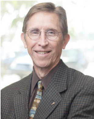
Special Projects Executive; Former President & CEO, Unity Health

“I believe the Baldrige Excellence Framework is one of the best structures and formats to help guide strategic planning. The criteria are broad to accommodate various structures while still going in depth. It is general enough to allow interpretations of the criteria to fit any organization, and in health care it is particularly appropriate and important.”