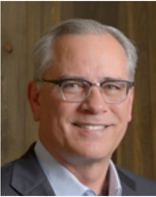
CEO, Elevations Credit Union

"Thank you, Baldrige Foundation, for recognizing me with the 2020 Award for Leadership Excellence in Business. Since Elevations Credit Union first began utilizing the Baldrige Excellence Framework in April 2009, our employees, membership, and community have all benefited tremendously. Elevations has experienced continuous improvement and growth thanks to how our high-performing team has embraced the Baldrige Framework. Because of our team's bold vision, hard work, and commitment to performance excellence, Elevations Credit Union will continue to thrive for generations to come. Thank you so much for this incredible honor."