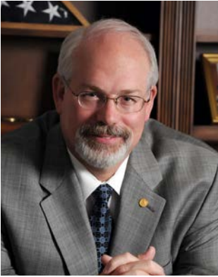
CEO Emeritus, CynergisTek, Inc.

“The Baldrige frameworks have for years provided the tools organizations need to build better programs to meet mission requirements. They are considered the gold standard and are highly coveted by health care. Now the Baldrige Cybersecurity Excellence Builder, a public/private collaboration, provides the tools this critical industry needs to understand how well their security controls support patient care and safety. I am a strong proponent of health care adoption of the NIST Cybersecurity Framework to provide them the comprehensive and dynamic vehicle they need to