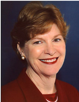
U.S. Senator, New Hampshire

"I'm grateful to receive the Baldrige Foundation Award for Leadership Excellence in Government. The Baldrige Program does important work providing organizations in sectors throughout the U.S. economy, from health care to education or nonprofits, with the resources and tools they need to be effective and efficient economic contributors. I appreciate this award, and I'll continue to support the Baldrige Program and those like it that invest in the innovation, sustainability and strength of our national and global economies."