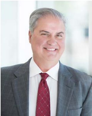
President & CEO, Yuma Regional Medical Center

“Baldrige has provided a map to the future for our origination. It has strengthened our position in our market and has resulted in elevated levels of employee and physician engagement, which has allowed us to provide higher quality and safer care to our patients. Our never-ending journey to achieve the highest quality care and patient experience possible is fueled by the passion of our employees. Baldrige provides the framework for all of us to be moving in the same direction toward the