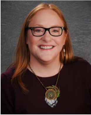
Vice President of Organizational Development and Innovation, Southcentral Foundation

“Southcentral Foundation (SCF) is led by an incredible group of leaders including the board of directors, CEO, and executive leaders who have spent more than 25 years transforming a health care system designed by and for Alaska Native people. I have been privileged to work as part of this team and in support of the work of Alaska Native people and the more than 2,500 SCF employees. The Baldrige Excellence Framework came